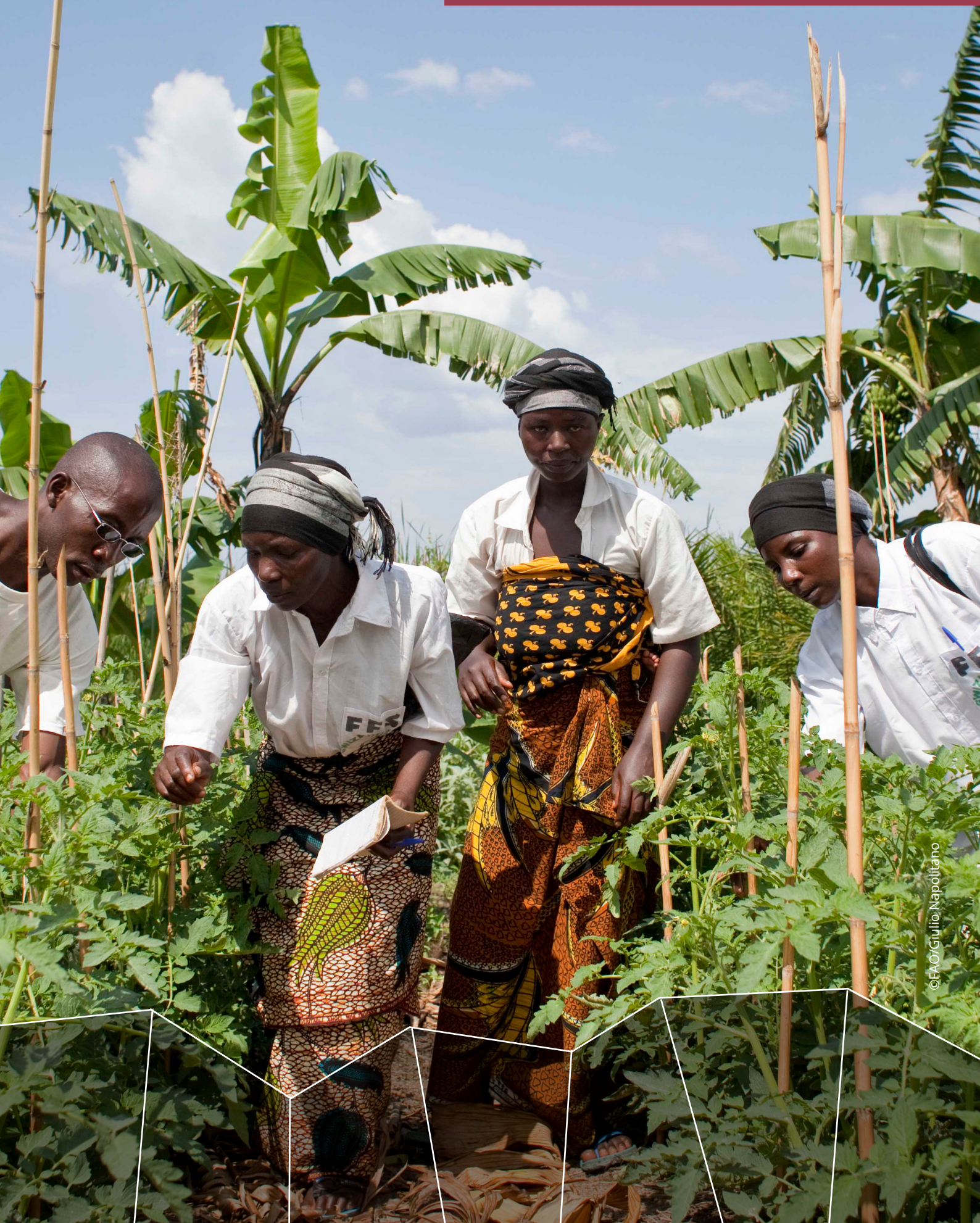
Burundi: Women from Mutambara I "Village de la paix" working on a tomato crop during their training activities.