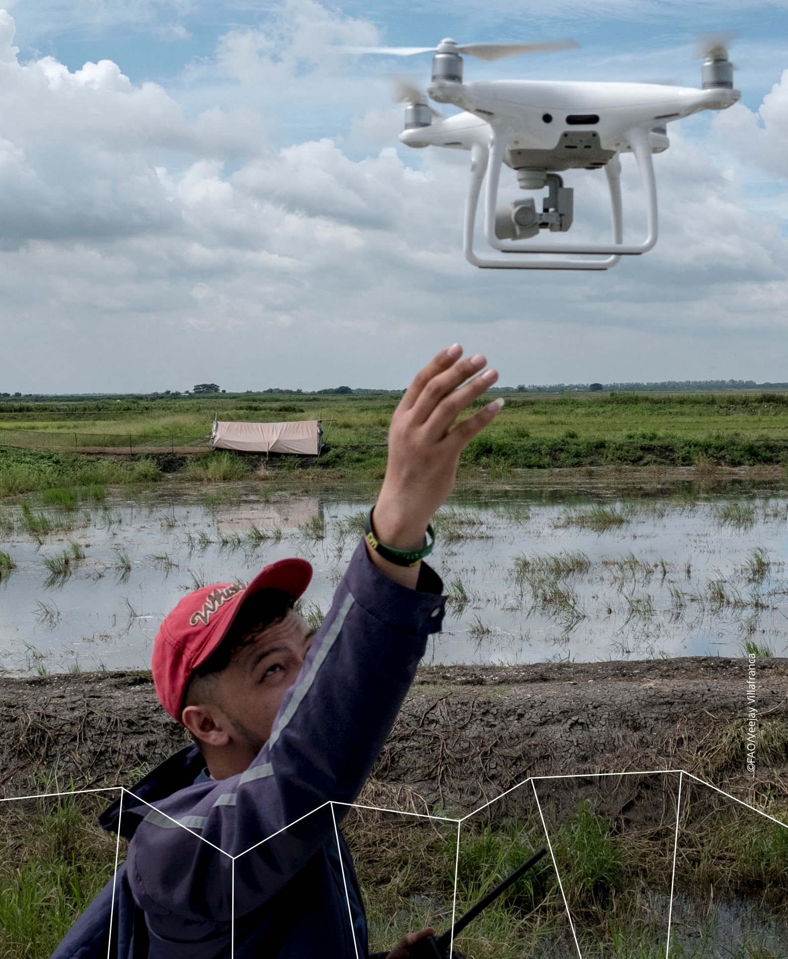
The Philippines: A team of experts from the Department of Agriculture work together with FAO in using drones in gathering visual data on damaged rice crops in Magalang, Pampanga province.