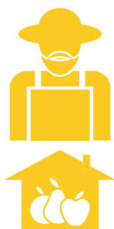
2. Conventional strugglers