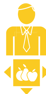
5. Business multifunctional

Most representative types in Southern Europe