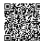
Guidance Note on Operationalization